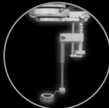
SeilerMax Adapter for use with wide angle, non-contact lenses