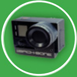
GO PRO HERO 4

LIVE CAPTURE OF HD IMAGES AND VIDEO AVAILABLE ON ALL MODELS