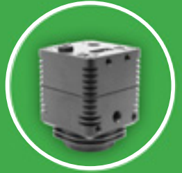
HD STREAMING VIDEO