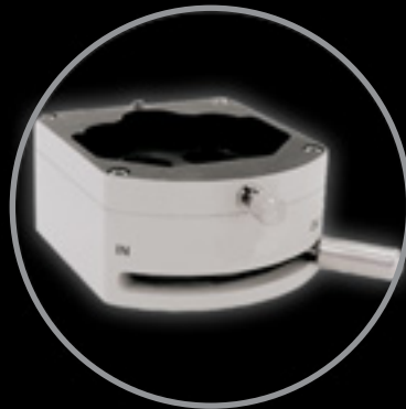
SRI Slim Image re-inverter system for vitrectomy surgery