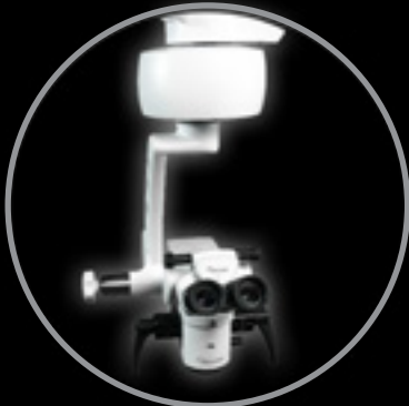
Motorized X-Y System