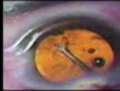
With Red Reflex