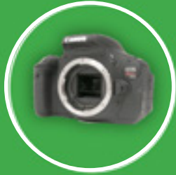
DIGITAL DSLR CAMERA OPTIONS: CANON EOS, NIKON D SERIES, SONY NEX